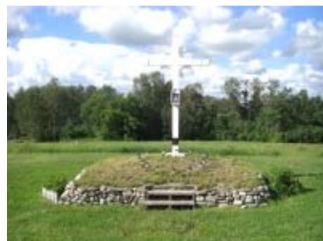
The Violette Settlement Cross