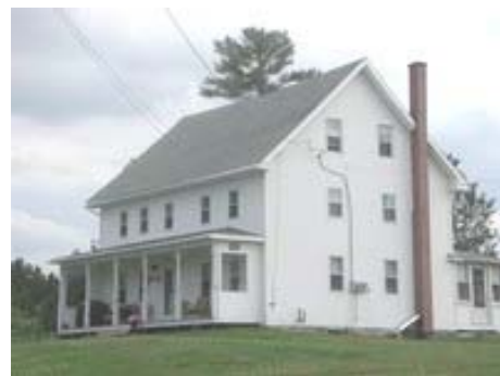
The Violette House, on Violette Street, has the original log house within the structure.

The photos below show just a few of the many features associated with the Violette family that you will be able to locate through our maps.